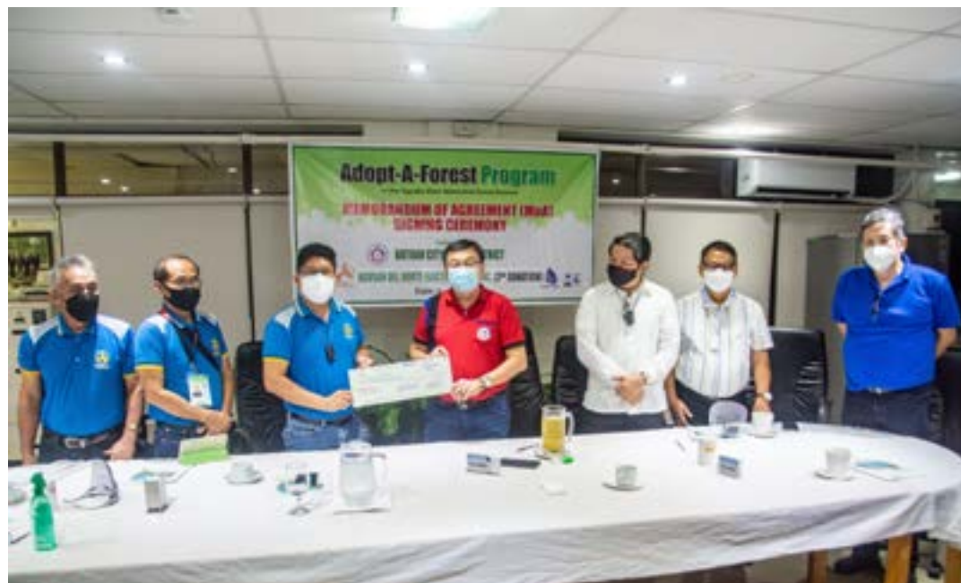
Representatives of the Agusan del Norte Electric Cooperative (ANECO) signed a Memorandum of Agreement (MOA) with Butuan City Water District (BCWD) for their 2 nd donation for the Adopt A Forest Program in the Taguibo River Watershed Forest Reserve (TRWFR) on August 05, 2021 at BCWD's Board Room, Butuan City