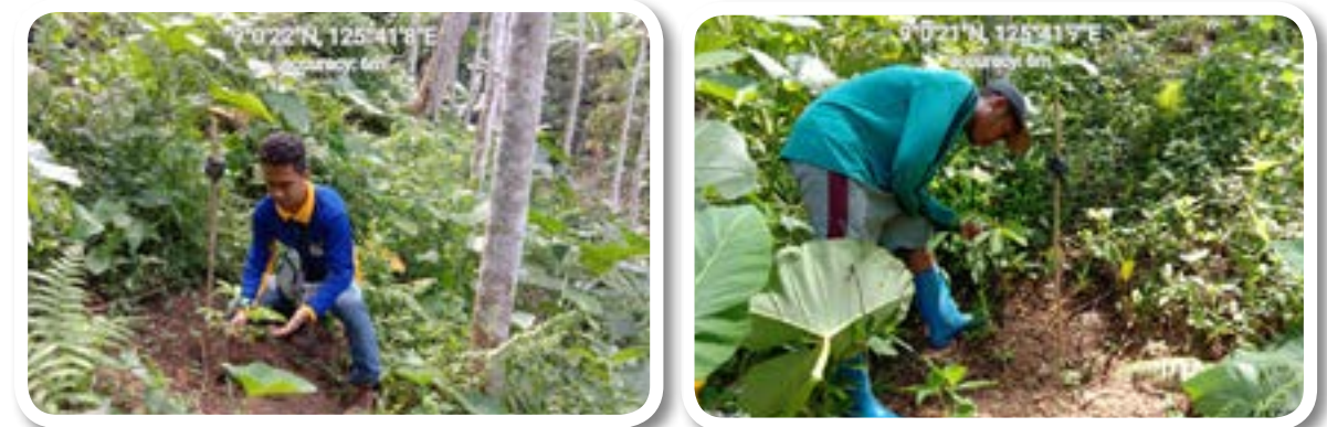
2 nd Pass (April 15, 2020)