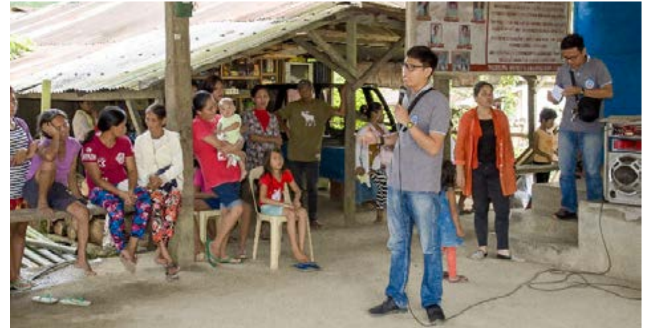
IEC/Information drive at the Taguibo Watershed