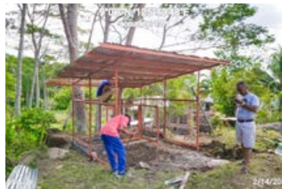
Sitio Mahayahay, Anticala MRF