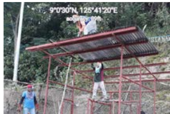
Sitio Tagkiling, Anticala MRF

BCWD provided technical assistance to Barangay Anticala particularly on the preparation of technical design, cost estimate and program of works of the MRF as it was one of the requirements for the grant. Said infra project is expected to be operationalized on the 4 th quarter of 2020.