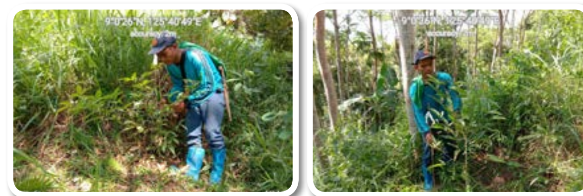
5 th Pass (April 14, 2020)