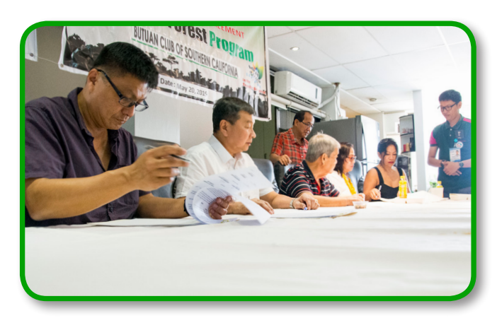
The MOA signing between BCWD and BCSC for the implementation of one (1) hectare Adopt-A-Forest Program in the Taguibo Watershed on May 20, 2019 was held at BCWD's Board Room. It was attended by BCWD board of directors and officers/members of BCSC.